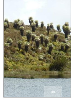
Páramos on Lake Tota basin highest-land are its major water source.